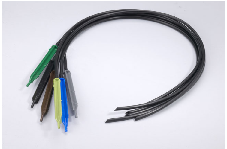
Cut 1/8" supply tube at 45° on one end and 90° on the other for easy, leak-free connection of a SPITTER to a lateral without barbs or fittings.

For more information on the use of Primerus 1/8" Spaghetti tubing with SPOT-SPITTER products, see SPOT-SPITTER Installation Instructions in the Downloads section of our website or call us at 1-855-SPITTER (1-855-774-8837) for a copy.