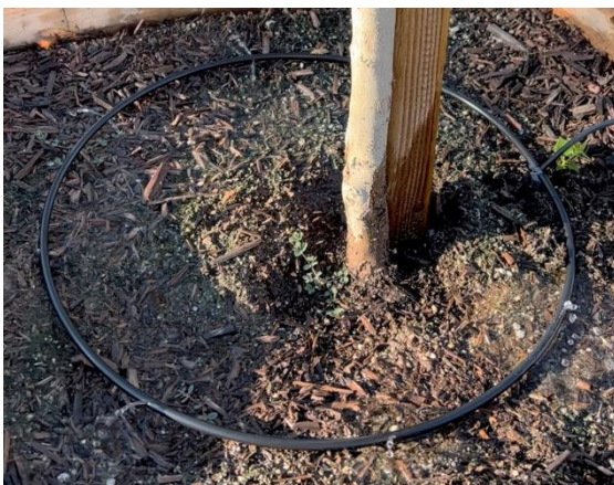
14" Drip Ring with Grey Stake in a 24" Box

Next, cut a piece of 1/8" Spaghetti Tubing long enough to connect your Pot-Dripper to a PE supply lateral. Insert one end onto the 1/8" supply connection on the Pot-Dripper stake. Cut the other end at 45° to create a point, use a Primerus Hole Punch to create a hole in your lateral, and insert the 45° end for a water-tight seal.